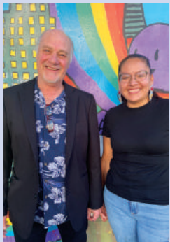
From left: San Francisco Staff, Board of Directors, Amherst Staff