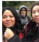
From left: Centro Comunitario de Trabajadores, New Britain Racial Justice Coalition

"The De Colores grant helped us to quickly respond to the spike in COVID cases by creating and distributing nearly 500 bundles, salves, masks, and containers of traditional medicines to Indigenous elders who were in great need." —People of the Confluence