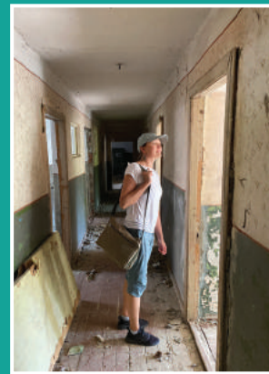
Project Nadiya Ukrainian rehousing

“Partnering with PDF as a grantee while we wait for our own 501c3 status allows us to attract more funding. Having PDF as our fiscal sponsor allowed us to start a project in Ukraine which involves refurbishing a disused building in a safer area of Ukraine to house displaced people and also to offer them social support—be it with psychological counseling, employment assistance or skills training.”