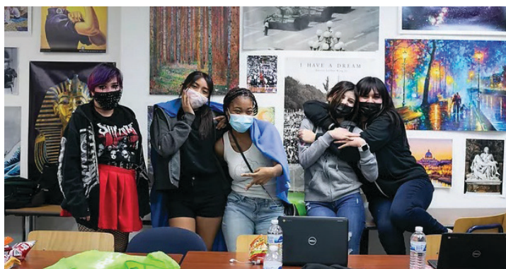
Tucson Youth and Peace